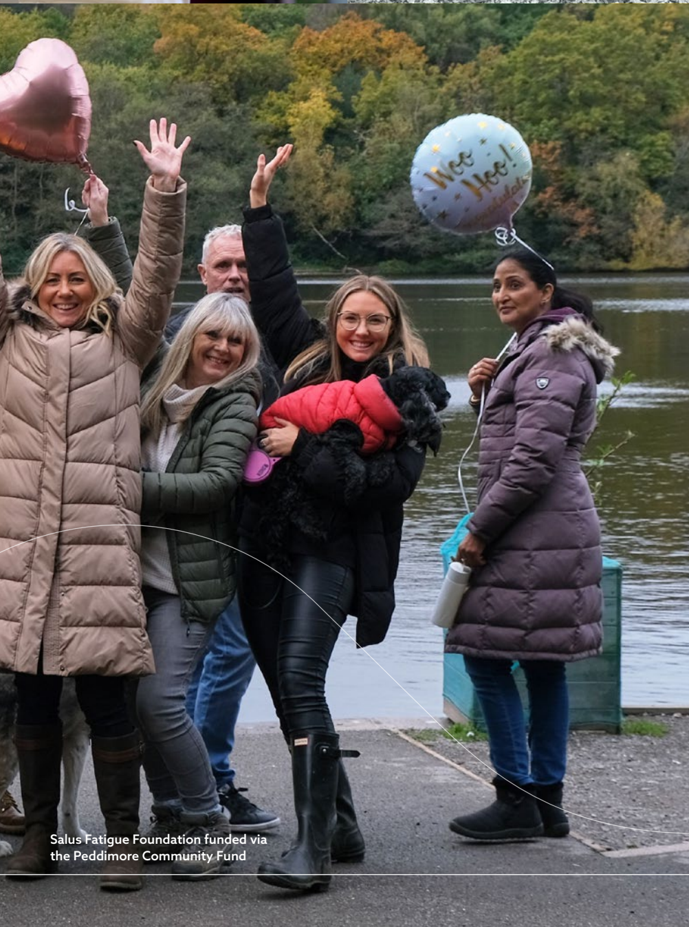
Salus Fatigue Foundation funded via the Peddimore Community Fund