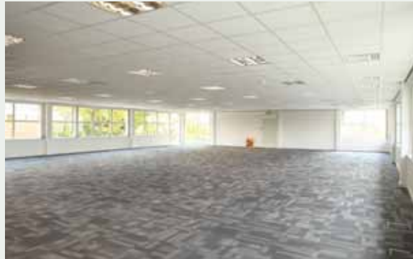
TYPICAL FLOOR LAYOUT